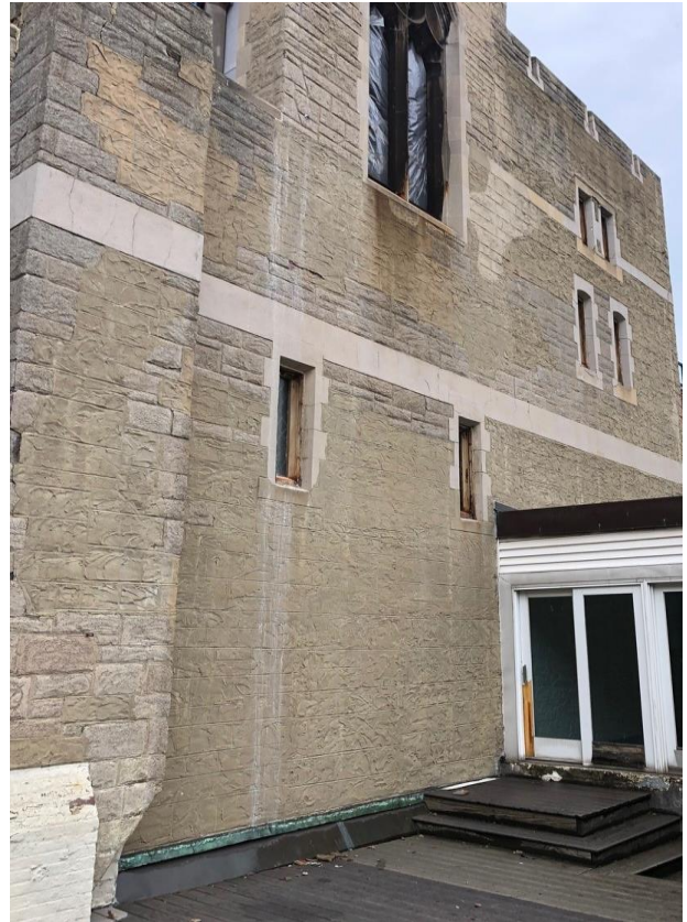
Photo: Before restoration conditions at Central Presbyterian Church. Multiple phases of previous repairs, damaged stone, and other masonry were removed to sound substrate prior to plastering.

Custom SYSTEM 45 Type ST can be used as the finish coat to produce custom finishes, that replicate natural stone or other types of masonry.