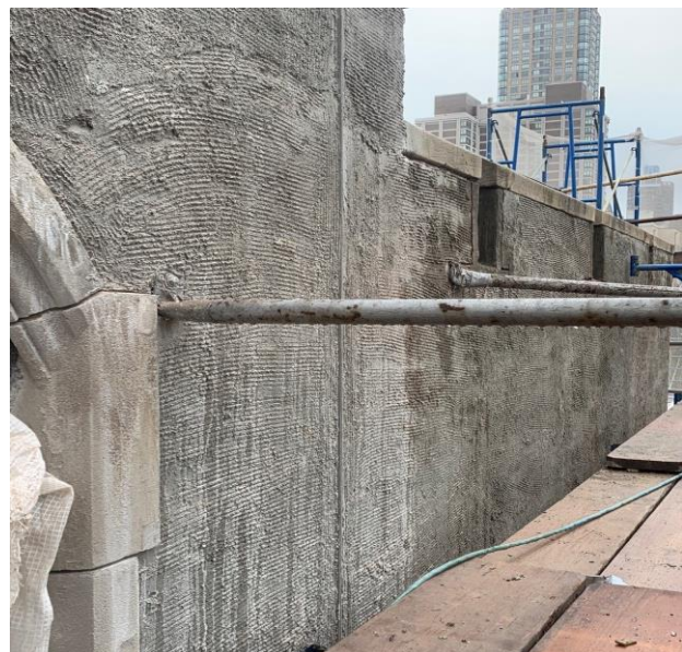
Photo: Cem-Plast 54 Base F/R is applied as the first coat and left rough to promote high bond strength of the subsequent Custom 45 Type ST finish coat.